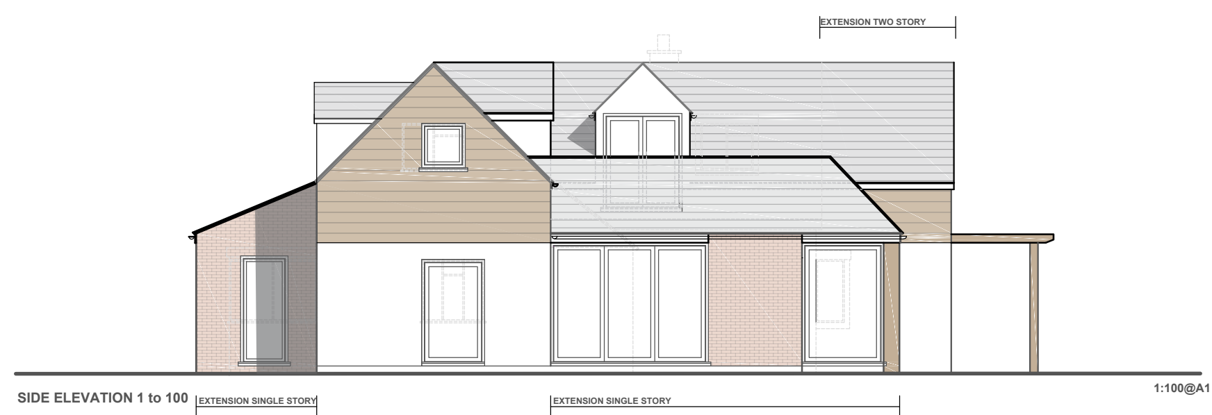
SIDE ELEVATION 1 to 100