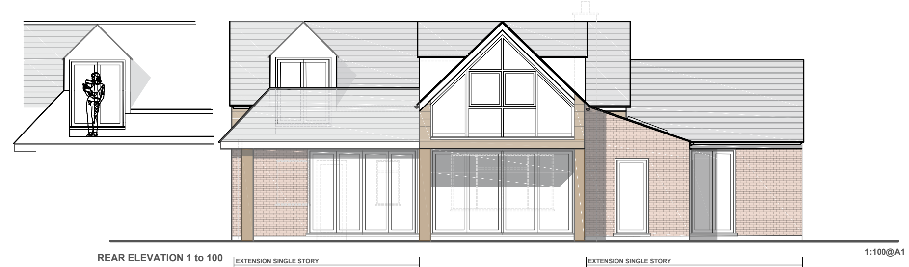
REAR ELEVATION 1 to 100