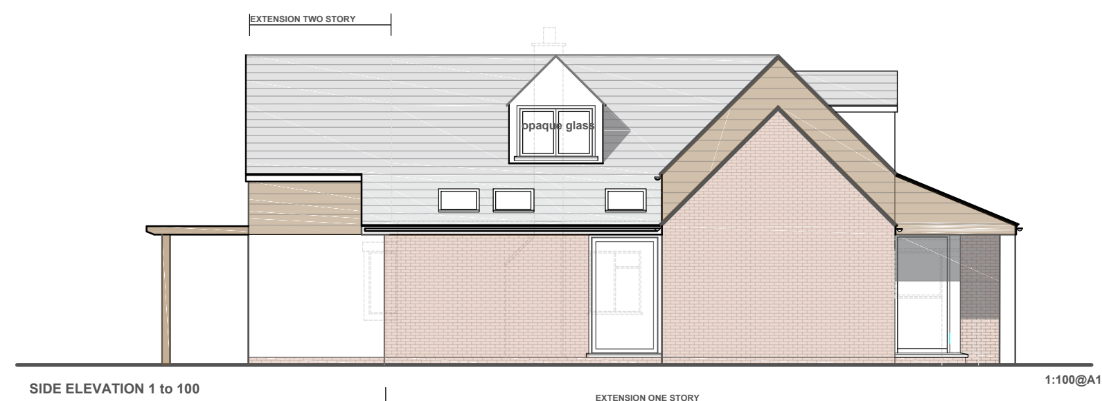
SIDE ELEVATION 1 to 100