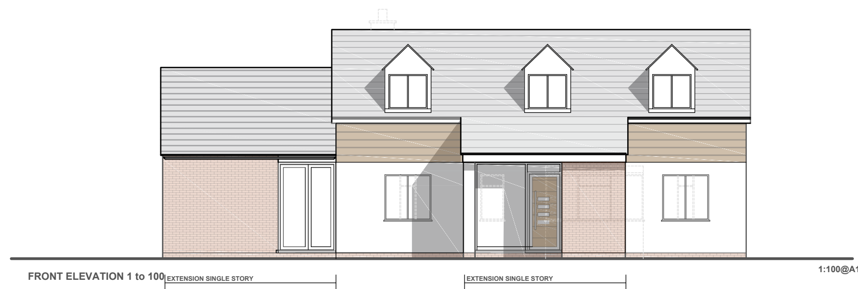
FRONT ELEVATION 1 to 100